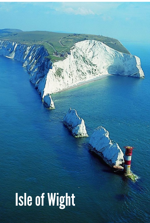
Isle of Wight